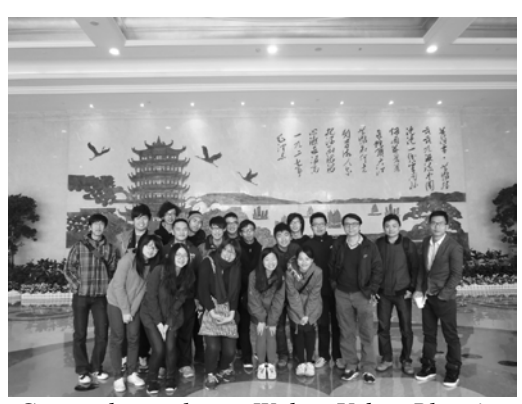
Group photo taken at Wuhan Urban Planning Exhibition Center