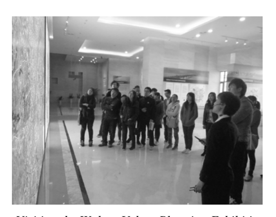
Visiting the Wuhan Urban Planning Exhibition Center