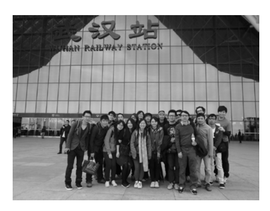
Wuhan Railway Station

As a metropolitan city with population of around 10 million in Central China, Wuhan provided the students with a good example demonstrating transportation issues in a major Chinese city. This trip provided students with the opportunity to observe and experience the high-speed railway development in China, and to learn about the urban transportation development and traffic problems in Wuhan. Students are encouraged to compare public transportation developments between Hong Kong and Wuhan. Through first-hand experience, this trip allowed students to apply their knowledge acquired from lectures and experiences gained from field studies investigate and better to transportation issues.